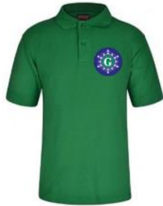
CRYS POLO GWYRDD (BATHODYN YSGOL DEWISOL) GREEN POLO SHIRT (SCHOOL BADGE OPTIONAL)