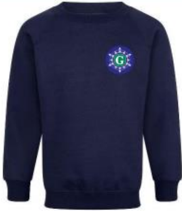
CRYS CHWYS GLAS TYWYLL (BATHODYN YSGOL DEWISOL) NAVY SWEATSHIRT (SCHOOL BADGE OPTIONAL)