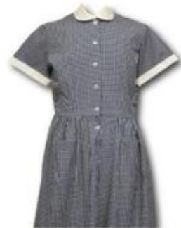
FFROG GINGHAM GLAS TYWYLL NAVY GINGHAM DRESS