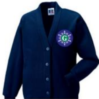
CARDIGAN GLAS TYWYLL (BATHODYN YSGOL DEWISOL) NAVY CARDIAGN (SCHOOL BADGE OPTIONAL)