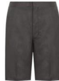
TROWSUS, SGERT, SIORTS TEILWREDIG NEU FFROG BINER DULWYD.